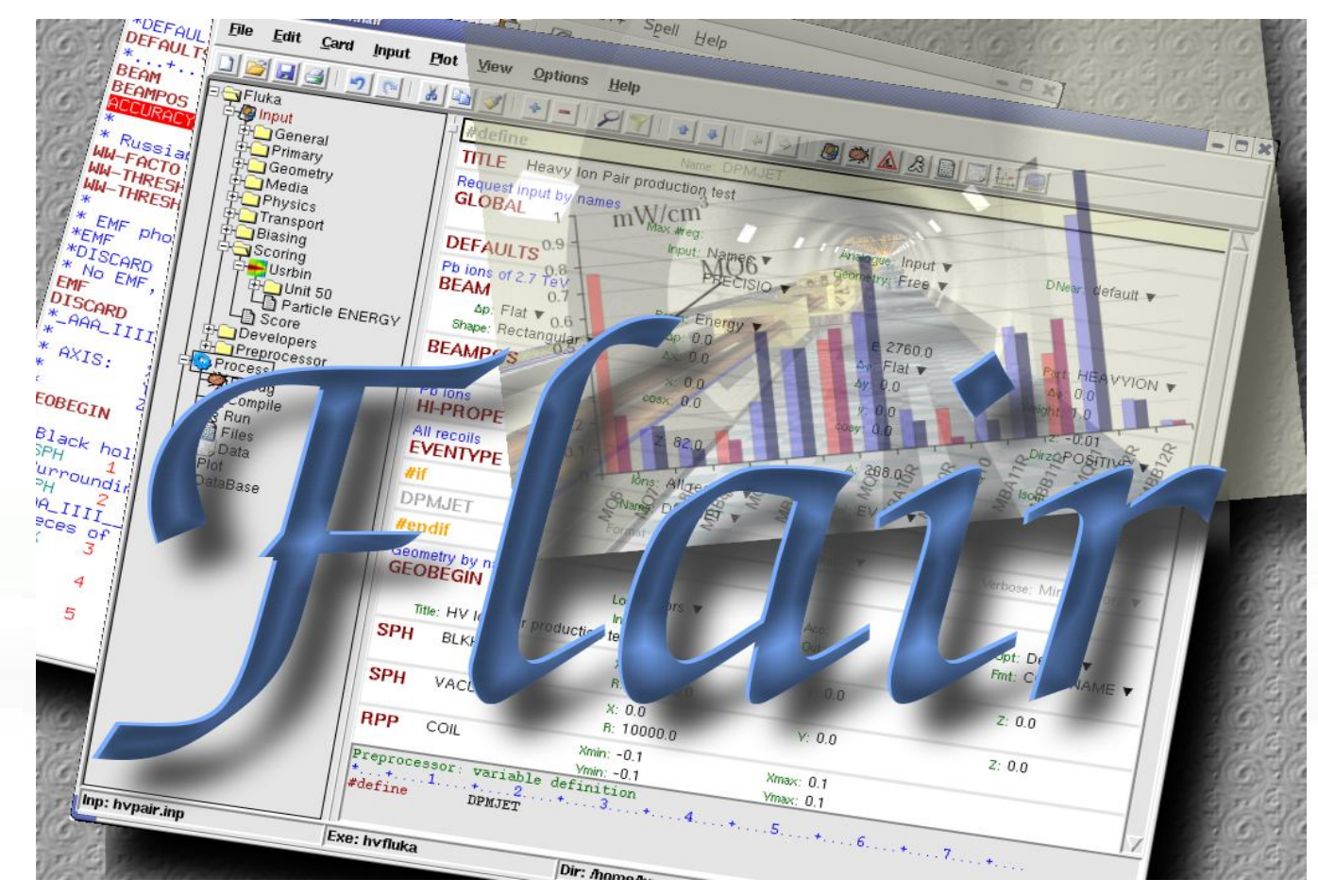
/fleə(r)/ n [U,C] natural or instinctive ability (to do something well, to select or recognize what is best, more useful, etc. [Oxford Advanced Dictionary of Current English]